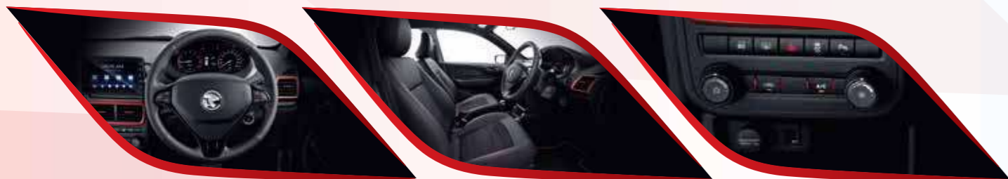
Leatherette Steering Wheel with Switches