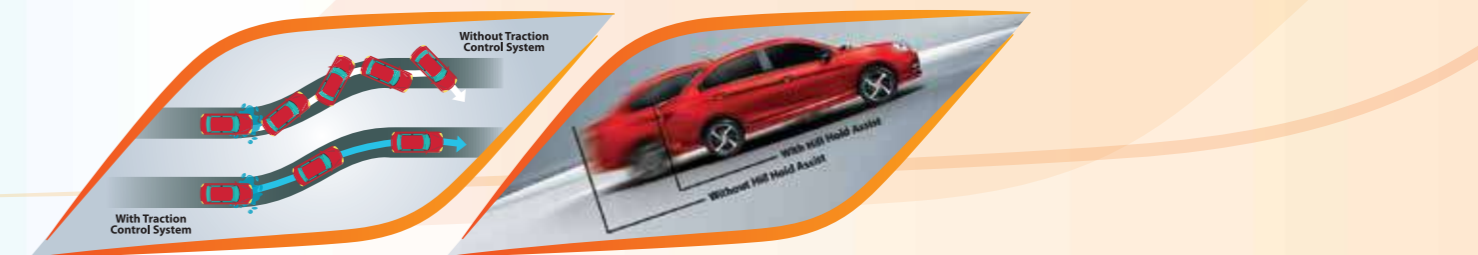
Electronic Stability Control and Traction Control System