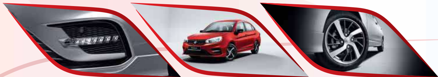
LED Daytime Running Lamps

With features that make your driving experience smoother, you can now turn your attention to the important matter of getting ahead.