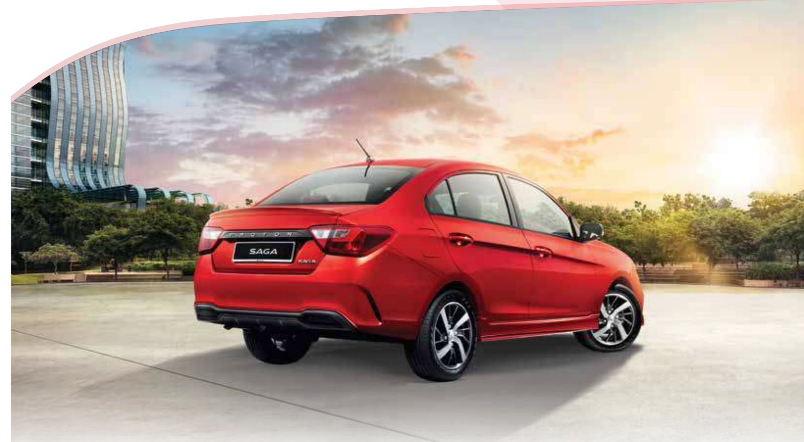
1.3L Premium S AT Semi Leatherette with Fabric