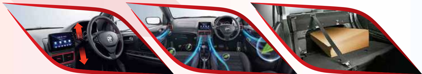
Steering Tilt Adjustment