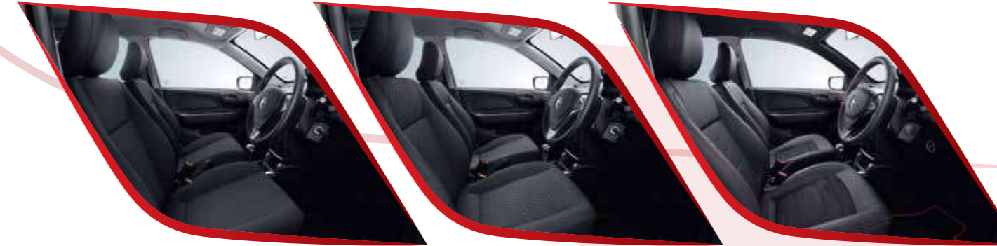
1.3L Standard AT Fabric