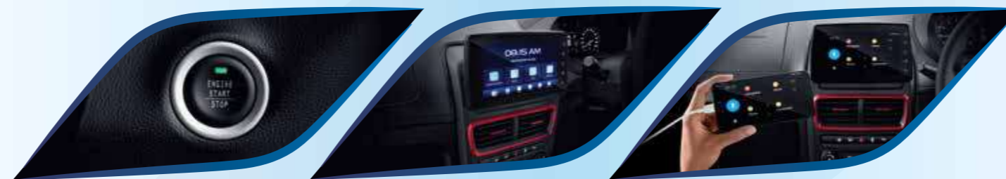
Push Start Button