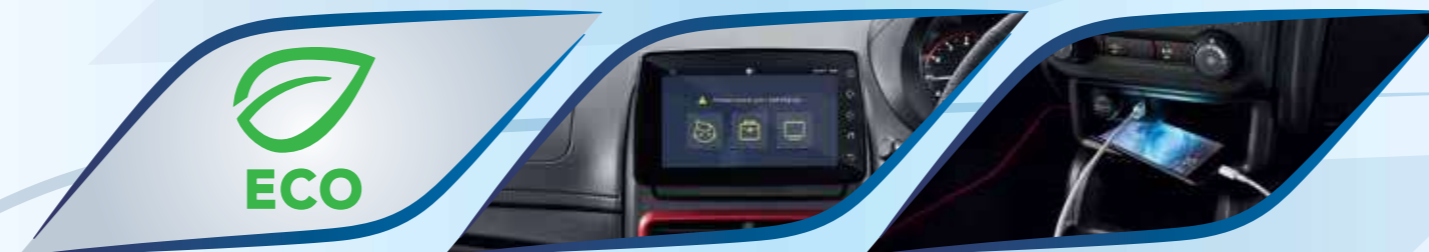
ECO Drive Assist