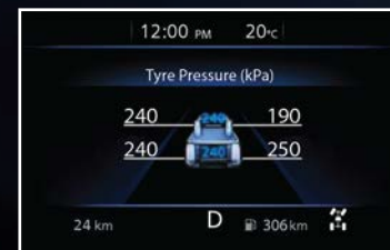
Tyre Pressure Monitoring System**