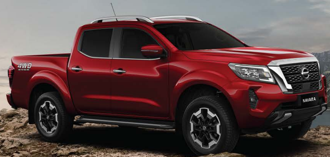
NAVARA 2.5L VL AUTO