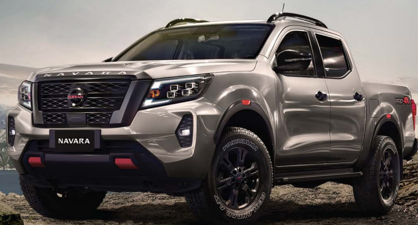
NAVARA 2.5L PRO-4X