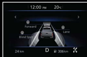
Visual Driving Aids for Nissan Intelligent Mobility

It's easy to be in control of the situation with Navara's Advanced Drive-Assist Display . Helping keep your eyes on the road with less looking away means you're focused and relaxed whether you're dodging boulders or negotiating city traffic. Navara's 7" Advanced Drive-Assist Display* puts up to 8 key information right where you want it. With a quick look down, you can get info on everything from music information to key driver's aid alerts. The system can even monitor your driving and suggest when you may need to take a break or stop for coffee.